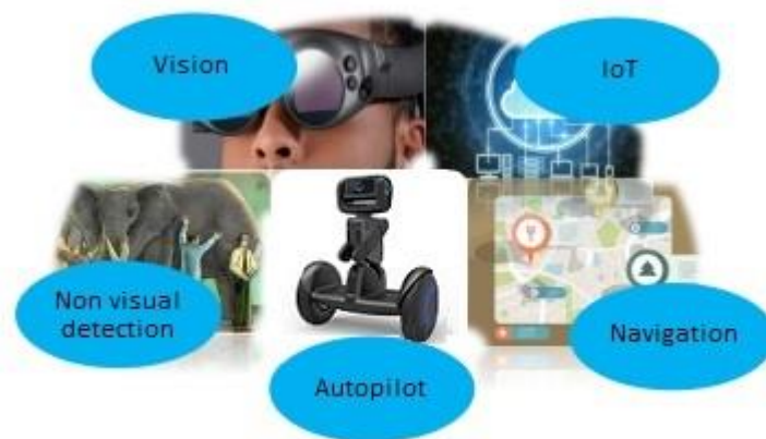
Figure 3 : Trends in PeTs devices and technologies

It can be predicted that the technologies shown in the figure below will become the driving technologies of PeTs.